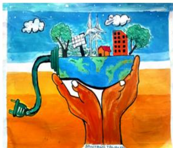
POSTER AND PAINTING COMPETITION