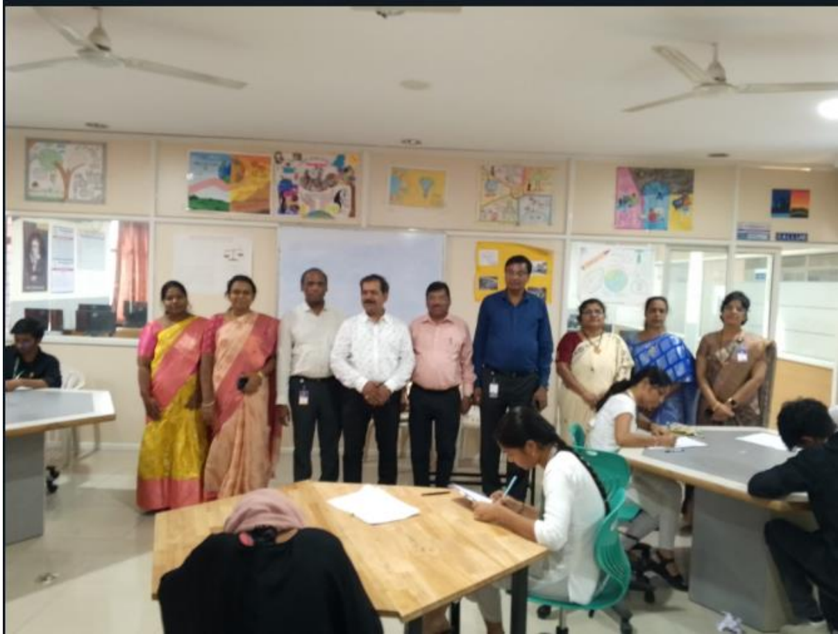
Head of the departments and faculty members judging the participants