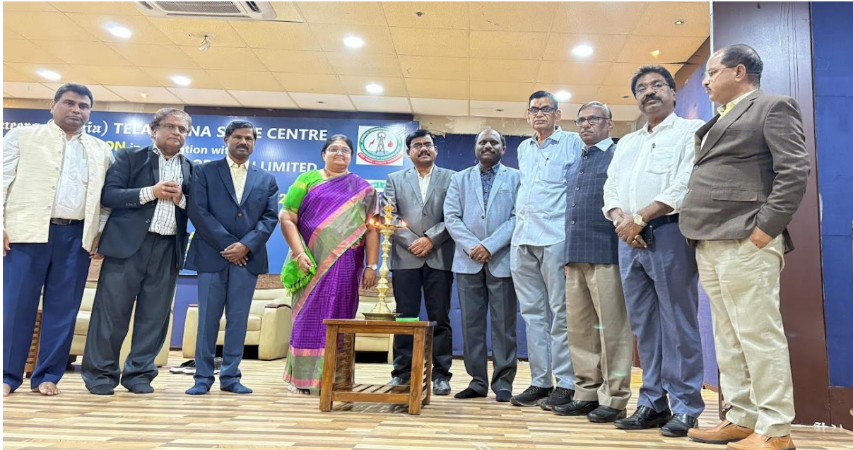
Lighting of lamps , a traditional and symbolic gesture that marked the beginning of the event.

The event began at 5:00 PM and was a highly informative and engaging session. Each speaker highlighted the critical need for energy conservation and how it can positively affect the environment, economy, and society. The insights shared by the esteemed guests provided valuable guidance for the participants and inspired them to become active advocates of energy-saving measures in their communities and future workplaces.