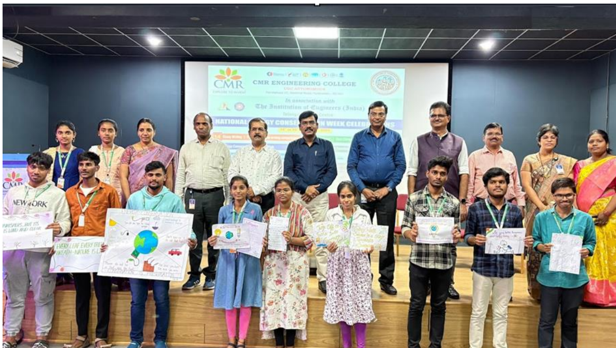
Slogan making competition held in CMREC Block -I Auditorium